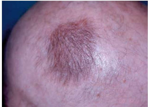
Figure 1. Regrowth in an alopecic area treated by infiltration of triamcinolone acetonide.

In short, the technique consists of sensitizing the patient with a laboratory allergen that is not normally found in the environment. Once obtained, the substance is applied to the affected area. A delayed eczematous reaction will