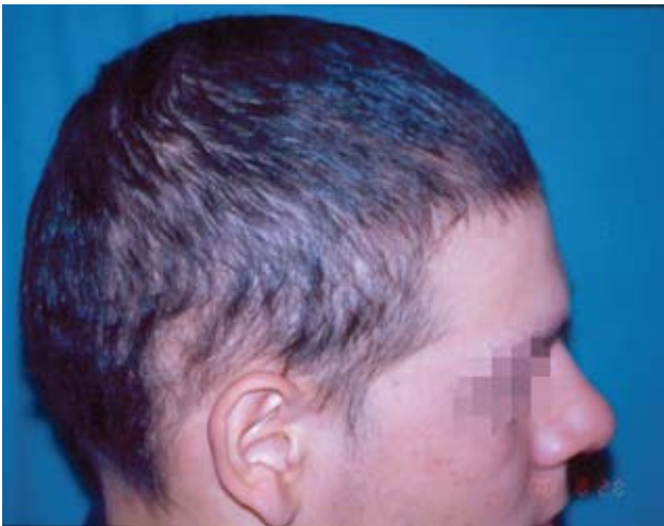
Figure 3. Outcome after 6 months' treatment with 500 mg/d of intravenous methylprednisolone for 3 consecutive days a month. Regrowth can be observed on almost 90% of the scalp.