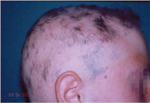
Figure 2. Image prior to treatment with pulsed intravenous corticosteroids.