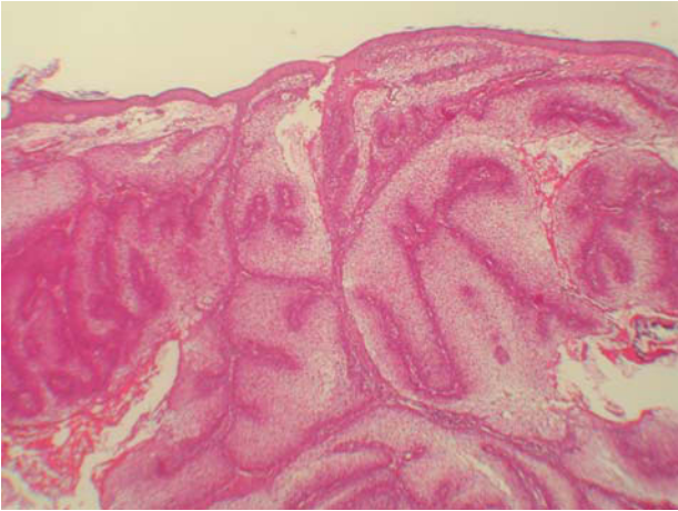
Figure 2. Well differentiated sebocytes in the superficial dermis grouping to form poorly defined lobes. No adnexal structures identified. (Hematoxylin–eosin, original magnification \times 100 ).