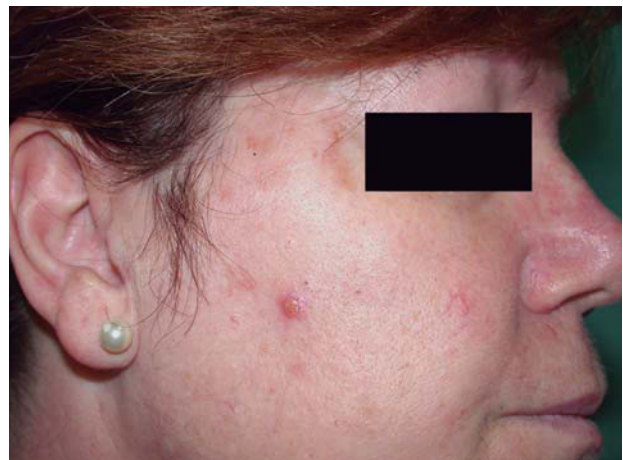
Figure 1. Yellowish papule on the right cheek.

example, a considerable proportion of patients originally diagnosed with sebaceous tumors (40%) actually had other types of clear-cell tumors or sebaceous hyperplasia.