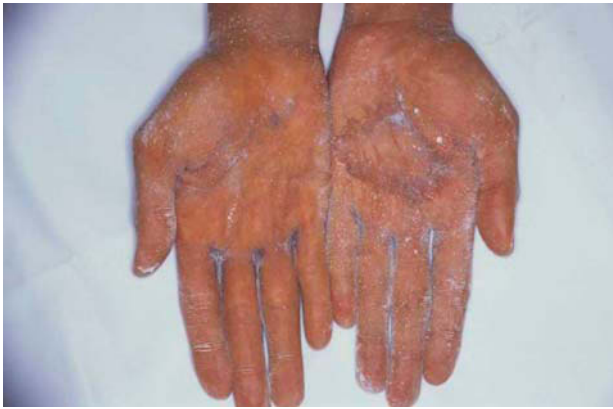
Figure 3. Minor starch-iodine test of the palms after treatment.