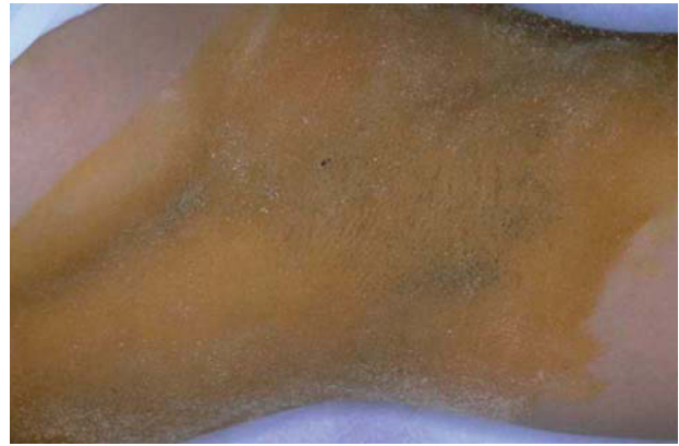
Figure 4. Minor starch-iodine test of the axilla after treatment.

hyperhidrosis by interrupting conduction in the sympathetic chain by resection (sympathectomy), electrocautery (sympathicolysis), or compression with metal clips.