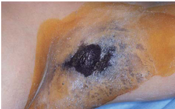
Figure 2. Minor starch-iodine test of the axilla before treatment.

hyperhidrosis, which is usually associated with other diseases such as infection, malignancy, neurologic and endocrine disorders, and medication-induced disorders.