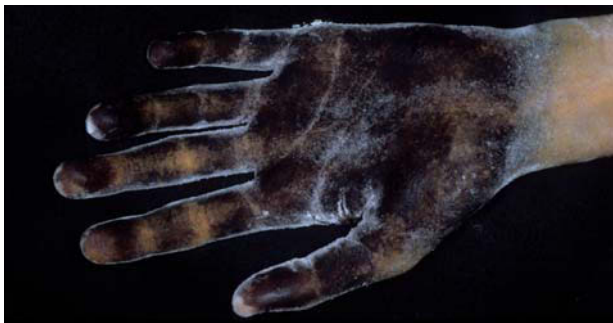
Figure 1. Minor starch-iodine test of the palm before treatment.

a At least 2 items in the list are necessary for the diagnosis.