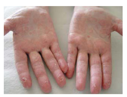
Figure 1. Hyperkeratotic erythematous lesions on both palms.

Meanwhile, isotretinoin has been shown to be effective in the treatment of chronic discoid lupus erythematosus, and it can also be employed as a maintenance treatment at doses of 40 mg on alternate days.4 This treatment has similar side effects to acitretin but a lower risk of teratogenesis, which means that female patients prescribed the drug need only take contraceptive measures during treatment and for a month after this is suspended. In the case described here, the patient was planning a pregnancy in the medium term, whereby acitretin was rejected in favor of isotretinoin.