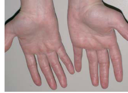
Figure 2. Improvement of lesions following 5 months of treatment with isotretinoin (20 mg/d).