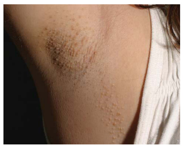
Figure 1. Multiple whitish-yellow follicular papules in the axillary region.