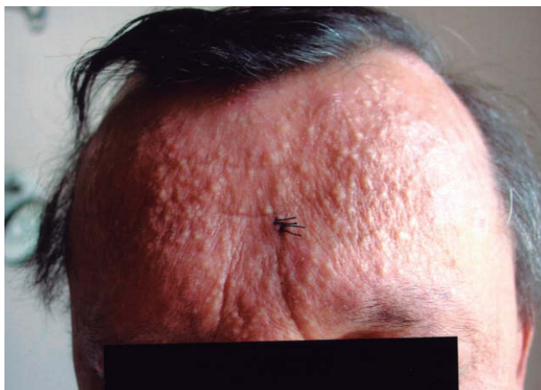
Figure 3. Multiple cysts on the forehead.