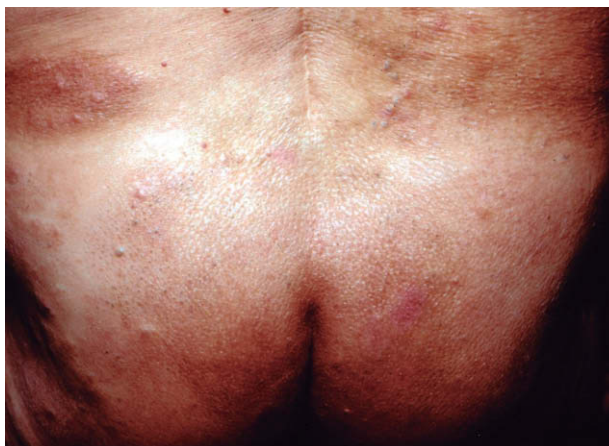
Figure 2. Pink plaques and cystic lesions that look like comedones.