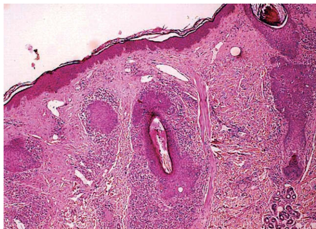
Figure 4. Infiltrates with a perifollicular and intrafollicular distribution and sparing of the epidermis (hematoxylin-eosin \times 50 ).