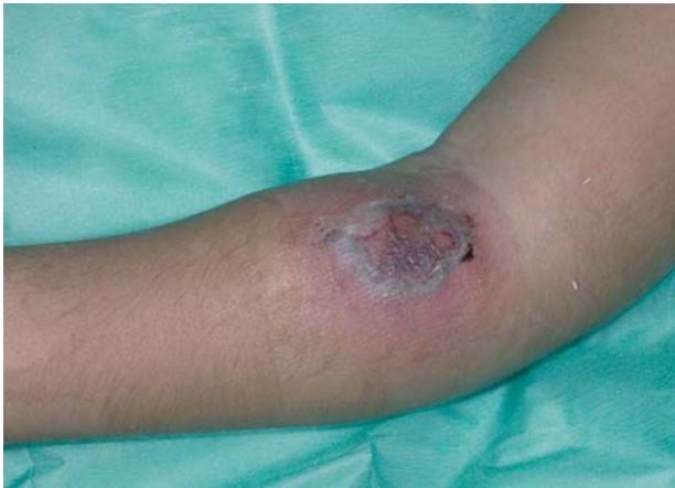
Figure 1. Ulcer with violaceous border and large blackish central scab.