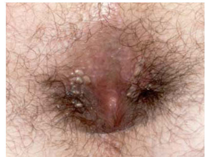
Figure 1. Visual appearance of the perianal lesions.