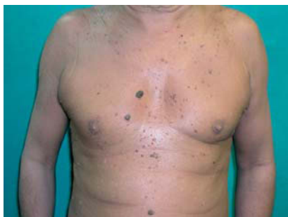
Figure 1. Numerous grayish papules on the thorax and abdomen with erythroderma and cutaneous thickening.

Various hypotheses have been proposed for the pathogenesis of Leser-Trélat sign; all of them consider that the tumor might secrete a growth factor that stimulates the formation of these lesions 1,4-6 and could explain the