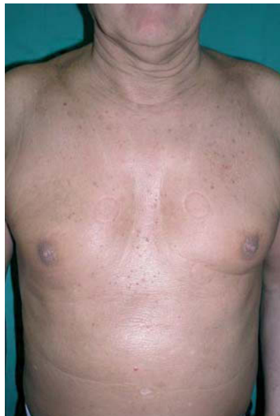
Figure 2. Patient's skin after treatment of both neoplasms. The erythema and cutaneous thickening seen in the previous images and seborrheic keratoses have disappeared.