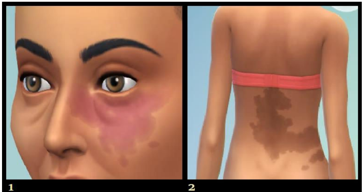
Figure 2. 1) Facial hyperpigmentation in Dragon's Dogma. 2) Vitiligo in Baldur's Gate.