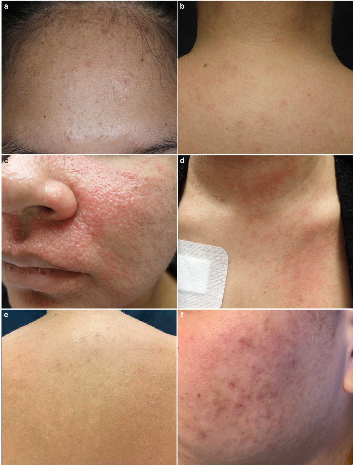
Figure 1 Clinical presentation of demodicosis in patients #1 (a), #2 (b), #3 (c-e) and #4 (f). (a) Small pustular lesions over the forehead. (b) Maculopapular rash and pustules on the upper back. (c) Confluent maculopapular exanthema involving the perioral and malar regions. (d, e) Maculopapular rash and micropustules over chest and back. (f) Malar pustules and erythema.