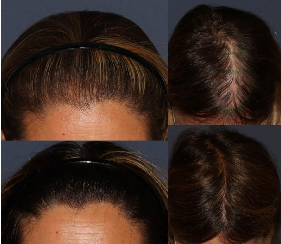
Figure 2. Hair transplant in 2 of the patients. Results before (upper region) and 12 months after surgery (lower region) in the frontal and interparietal combing areas.