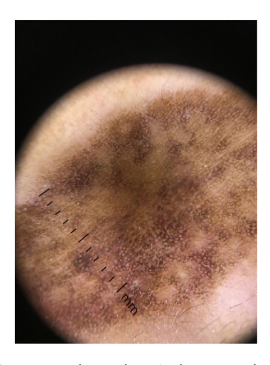
Figure 2 Exaggerated pseudoreticular network with light and darker brown dots in linear, peppering/nonspecific, reticular, and incomplete reticular arrangements. Fewer grayish globules seen as nonspecific and polygonal patterns. In some areas, blotch structures could be seen. Lastly, blue-gray annular granular structures could be seen in peri-eccrine areas.