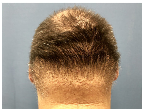
Figure 1 Lipedematous alopecia in the occipital area.

A 33-year-old man presented with many years of progressive hair loss. He had a mild mental retardation associated with epilepsy and he was treated with fluvoxamine and aripiprazole. He denied any history of trauma or surgery in the scalp. Physical examination revealed a diffusely thickened, boggy scalp, mainly localized in the occipital area, with no clinical signs of inflammation (Fig. 1). Androgenetic alopecia was associated with miniaturized hairs in the interparietal area. Trichoscopy revealed areas with big orange to yellow