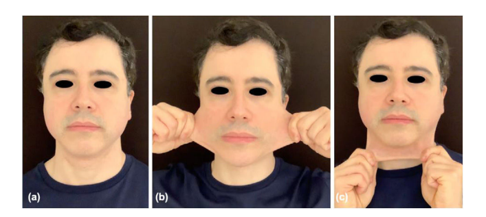
Figure 2 Patient's facial evaluation 180 days after the first treatment protocol – two sessions of full-face treatment with a monthly interval in 2019. Rest position (a), lateral skin extensibility (b) and anterior skin extensibility (c) exhibiting a significant collagen stimulus with improvement of skin contouring and tightening.

recommended parameters. The patient underwent two sessions of full-face treatment with a monthly interval in 2019. The full-face protocol has been performed with transducers of 2, 3 and 4.5 mm, pitch 1.5 mm, length 25 mm, 0.7 J energy, with a total 70 lines per hemiface. The treatment has been temporarily interrupted during the COVID-19 pandemic due to the lockdown. The patient returned in 2021 and performed another two sessions of MFU with a monthly interval. 180 days after each treatment, we noticed a significant clinical improvement in skin laxity as shown in Fig. 2 (2019 protocol) and Fig. 3 (2021 protocol). The patient described progressive skin tightening with enhancement of self-esteem and quality of life.