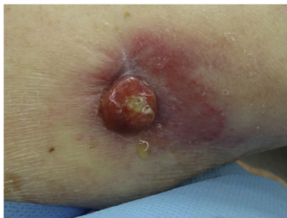
Figure 1 Clinical image.