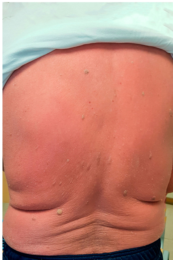
Figure 1 Diffuse erythema on a 71-year-old man's back, on the few days prior to admission.

During admission, weakness progressed to tetraparesis, with inability for limb movement against resistance. A lumbar puncture was carried out and cerebrospinal fluid came back negative for HSV 1 and 2, VZV, EBV, enterovirus and cytomegalovirus. He was diagnosed with Guillain-Barré syndrome (GBS), treated with intravenous immunoglobulin and recovered without sequelae.