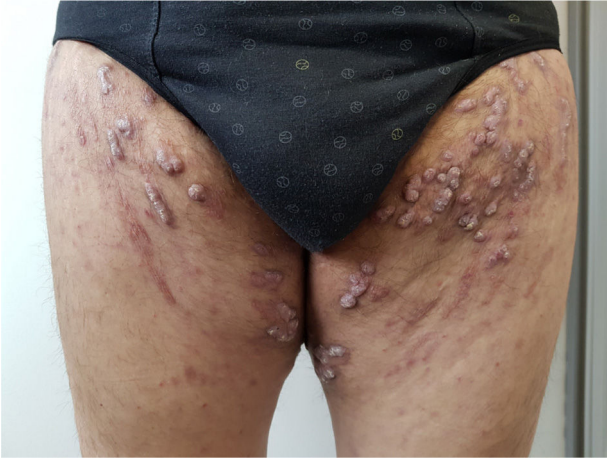
Figure 1 Ostraceous erythematous–desquamative plaques on distension striae in both groins.

6, IL-8, IL-17, IL-36 \gamma ), and increased expression of nerve growth factor (NGF) and vascular endothelial growth factor (VEGF). 5