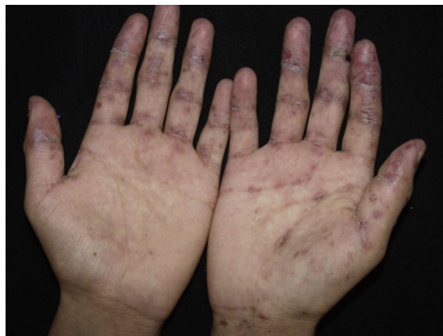
Figure 4 Several erosions on the palms of the hands, often recalcitrant.

Patients with PNP can develop life-threatening restrictive bronchiolitis obliterans. The frequency of the involvement