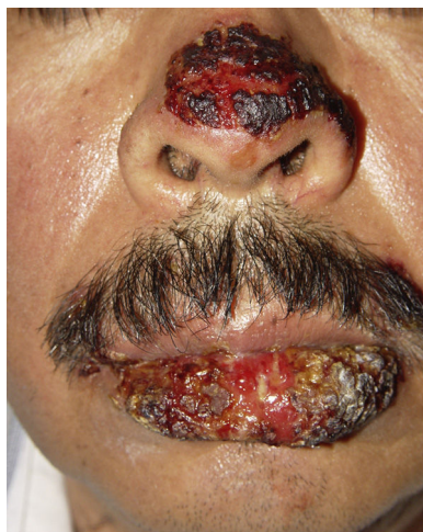
Figure 2 Severe oral mucositis, also involving the nose.