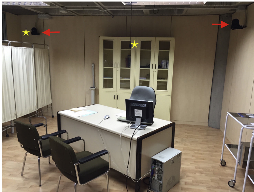
Figure 2 Clinical scenarios took place in simulated medical rooms with cameras (red arrows) and microphones (yellow stars) in order to evaluate students without interfere in their performance.