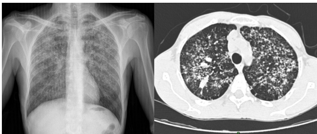
Figure 2 Chest X-ray and high-resolution computed tomography showing widespread bilateral reticulonodular opacities.

Extrapulmonary TB occurs in 15% of cases and can be the result of primary or reactivated TB. The organs the most commonly affected are the lymph nodes (40%), pleura (20%), urinary tract (15%), bone (10%), central nervous system (5%), and heart (3%). Multiple risk factors have been established for primary and disseminated TB, the most important of which are HIV infection (relative risk [RR], 30), hemodialysis (RR, 20), transplant (RR, 20), intravenous drugs abuse (RR, 20), and infection in the previous year (RR, 13). 2 A study on mortality in TB patients in Medellín, Colombia, detected social risk factors such as homelessness, drug addiction, or having no fixed address, in 58.1%. 3