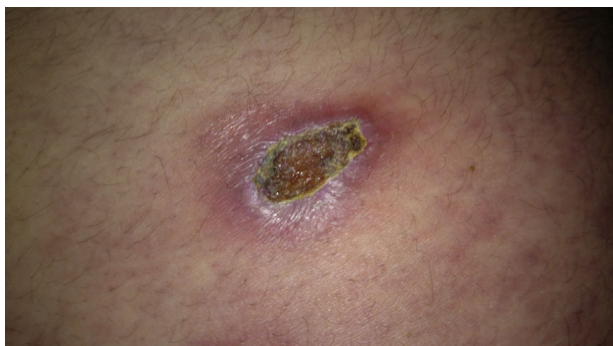
Figure 2 Patch with a necrotic central area and erythematous border on the abdomen.

Full blood count and biochemistry were normal, including liver and kidney function tests. Urinalysis was unremarkable. Autoimmune screening revealed a polyclonal hypergammaglobulinemia, positive anticardiolipin M (48 U/ml), and positive antinuclear antibodies (titer, 1:160) with a speckled pattern. Complement was normal and the extractable nuclear antibodies panel (Smith, ribonucleoprotein, Ro, La, Scl-70, Jo-1), double-stranded DNA, antineutrophil cytoplasmic antibodies (ANCA), and cryoglobulins were negative. Serology for human immunodeficiency virus (HIV), hepatitis C virus (HCV) and hepatitis B virus (HBV) were negative and coagulation studies were normal. Chest X-ray did not show any relevant features. A full-thickness skin biopsy showed a leukocytoclastic vasculitis of the superficial and deep dermal and subcutaneous vascular plexuses, with some thrombotic features (Fig. 3). Urine drug screening was not performed. Based on these tests, we made a diagnosis of cutaneous leukocytoclastic vasculitis secondary to the use of levamisole-contaminated cocaine. The patient was treated with topical copper sulfate 1:1000 and betamethasone dipropionate, 0.05%, for 2 weeks, with an excellent response and complete clearance of the lesions without scarring, and no new lesions developed. The patient did not attend follow-up appointments.