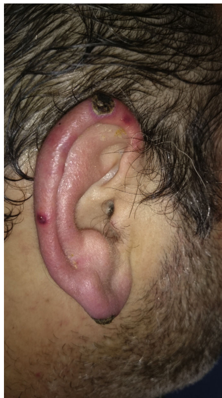
Figure 1 Patches with a necrotic central area and erythematous borders on the right ear.

At presentation, symmetrical, bilateral erythematous-violaceous patches were observed on his ears (Fig. 1) and on the lateral walls of the abdomen (Fig. 2). Over the following days, the lesions became infiltrated edematous papules and plaques that subsequently progressed to ulcerated necrotic plaques with an erythematous halo.