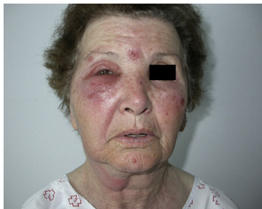
Figure 1 Edematous plaque on the right periorbital area.

On physical examination, the patient had a healthy appearance, was afebrile, and presented a tender,