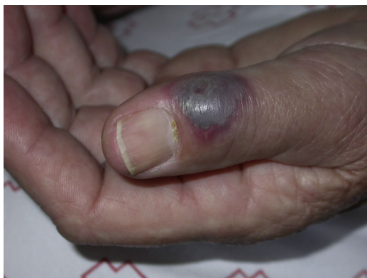
Figure 2 Violaceous plaque on finger.

Two weeks later, the patient had a recurrence, with the reappearance of an erythematous, edematous plaque in the right periocular area, associated with bullous papules on both arms and hands. These lesions were initially bright red, but progressively darkened to a violaceous color, giving the appearance of hematomas (Fig. 2). There was no malaise or fever. Laboratory studies were within normal limits, including the peripheral eosinophil count. The total IgE concentration was 910 kU/L.