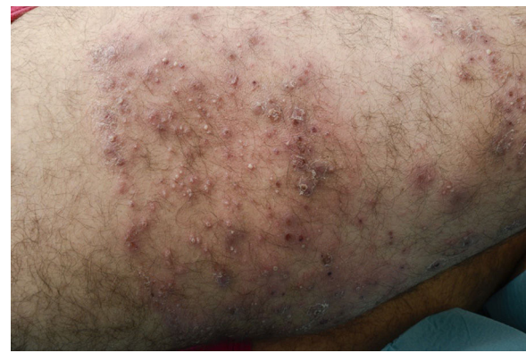
Figure 2 Case 2: erythematous plaques, follicular pustules and nodules in the right lower limb.

A 37-year-old Caucasian male presented with a 2-month history of an annular plaque on the hypogastric area. He was treated with topical triamcinolone acetonide and econazole nitrate combination for suspected tinea corporis. The patient developed painful erosions with yellowish crusts shortly after he shaved the area and he was treated for herpes simplex infection and impetigo with acyclovir and flucloxacillin later changed to clindamycin without showing any improvement. The lesions progressed to ulceration and the patient developed malaise and intense pain which impeding walking (Fig. 1A). He was admitted to the dermatology ward with the suspicion of pyoderma gangrenosum. On examination he presented with a 15 cm infiltrated ulcerated plaque at the hypogastrium with satellite follicular pustules and nodules on the abdomen and the legs. Inguinal lymph node enlargement was present. Punch biopsies of the pustules and the ulceration were performed. Examination showed intense perifollicular suppurative inflammation, with the presence of neutrophils in the deep dermis and subcutaneous tissue. Periodic acid Schiff (PAS) and Grocott staining showed the presence of fungal spores in the hair follicle (Fig. 1B) and Trichophyton mentagrophytes was isolated from culture of the skin scrape with hair shaft. He was treated with prednisolone 60 mg daily, with gradual tapering, and terbinafine 250 mg daily for 8 weeks with