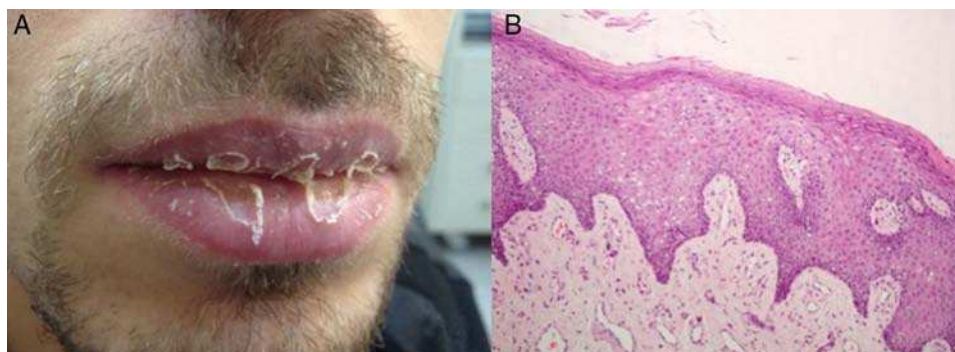
Figure 2 (a) Whitish scales on the vermilion borders of both lips in patient 2 before treatment. (b) Mounds of parakeratosis and hypogranulosis, acanthosis, and dilated, vertically elongated papillary vessels (hematoxylin-eosin, original magnification \times 20 ).