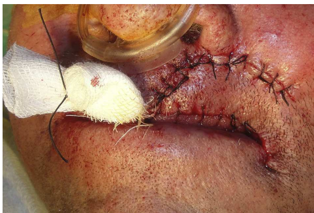
Figure 2 First stage of reconstruction. A cutaneous rotation flap with a lateral pedicle was fashioned from the left half lip, and the vermilion border (Klein's line) was recreated by suturing the lateral tongue flap to the skin flap.

neous lip flap with 4/0 silk (Fig. 2), and the tongue was fixed to the upper right half lip with 2/0 silk.