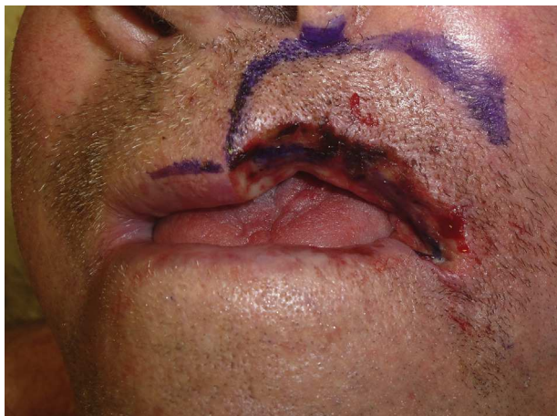
Figure 1 Defect of 3.5 cm×2 cm after 3 stages of Mohs micrographic surgery to the left upper lip. There is a large defect of the muscle and mucosa and a small skin defect.