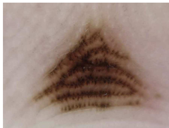
Figure 4 Parallel furrow pattern (double dotted-line variant) in the center of the right palm of a 46-year-old man.