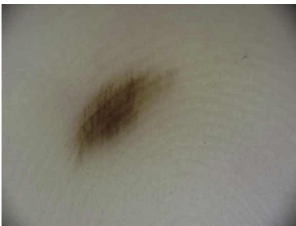
Figure 6 Fibrillar pattern in a melanocytic nevus on the right heel of a 31-year-old man.

On the soles, 28 nevi (17.7%) were located on the arch, 20 (12.7%) on the external aspect of the sole, 16 (10.1%) on the volar aspect of the digits, 8 (5.1%) on the heels, and 5 (3.2%) in the metatarsal sole area. The parallel furrow pattern was also the most common pattern in all locations ( n=36 , 46.7%) except the heel, where it was the fibrillar pattern. Table 1 summarizes the distribution of dermoscopic patterns according to the anatomical site of the lesion.