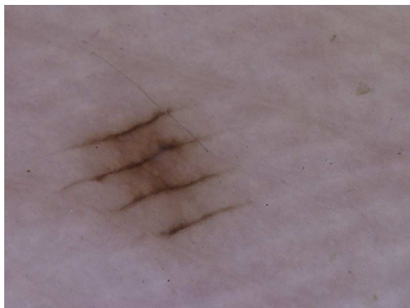
Figure 1 Parallel furrow pattern in a melanocytic nevus located on the thenar eminence of the right palm of a 36-year-old woman.

digits, external aspect of the sole, and the metatarsal sole area.