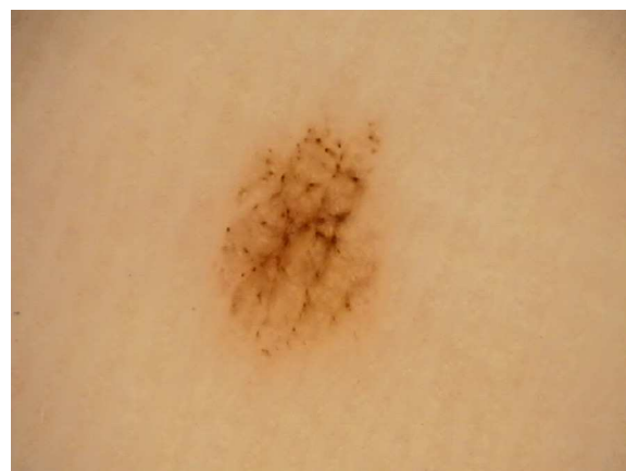
Figure 3 Globular pattern associated with a parallel furrow pattern on the heel of the left sole of a 27-year-old woman.