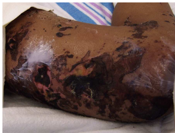
Figure 1 Widespread areas of purpura and necrosis on right lower extremity with lysed bullae and crusting.

Blood cultures came back as predominantly gram positive cocci in chains consistent with Streptococcus pneumoniae . The antimicrobial regimen was adjusted to linezolid, vancomycin, meropenem, abelcet, and ganciclovir for active coverage of S. pneumoniae septicemia and