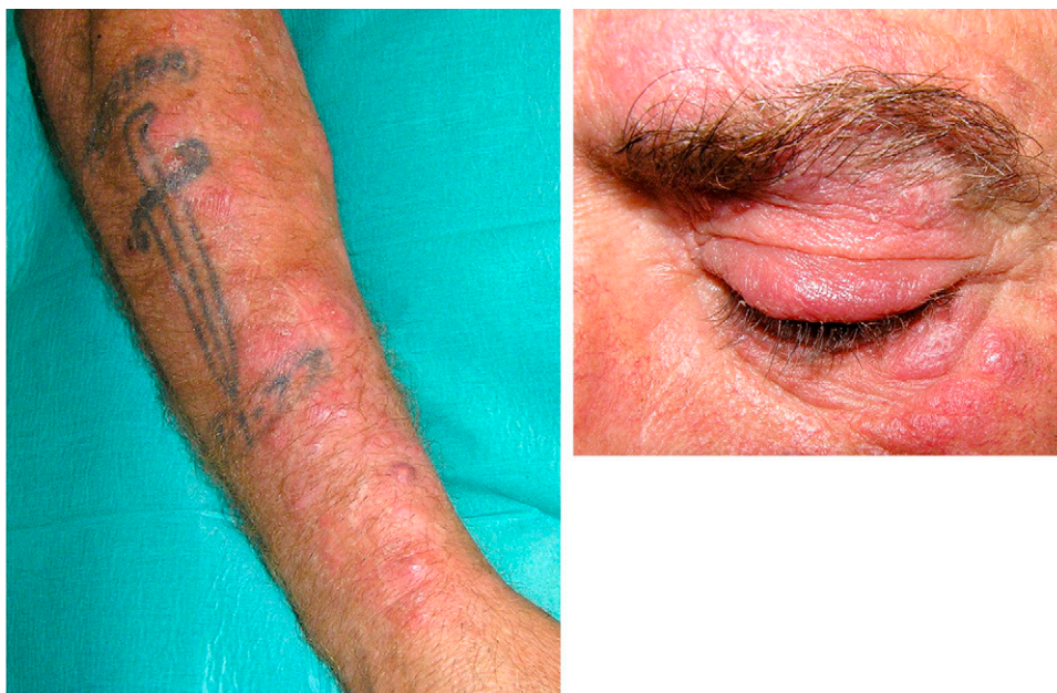
Figure 1 (A) Multiple painful erythematous nodules on the right forearm. (B) Multiple painful erythematous nodules in the left periorbital region.

our patient; indeed, after Candida species, these fungi are the most frequent opportunistic pathogens in this group of patients. 1,2 Cutaneous aspergillosis is normally a manifestation of disseminated disease, which typically begins as a pulmonary infection. 1 Primary cutaneous aspergillosis is rare but it can occur, especially in the case of skin injury, 4 such as that caused by a rabbit bite.