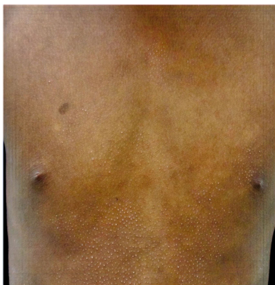
Figure 3 Lichen spinulosus-type mycosis fungoides.

vincristine). A patient with folliculotropic MF initiated treatment with PUVA and interferon (3 million units 3 times per week). Of the 22 patients who received phototherapy, 14 (64%) achieved complete remission and 8 (36%) achieved partial remission. Phototherapy was well tolerated, except for 1 patient, who experienced photo-onycholysis associated with PUVA after 48 sessions. This patient's therapy was suspended, and treatment with narrowband UV-B was started.