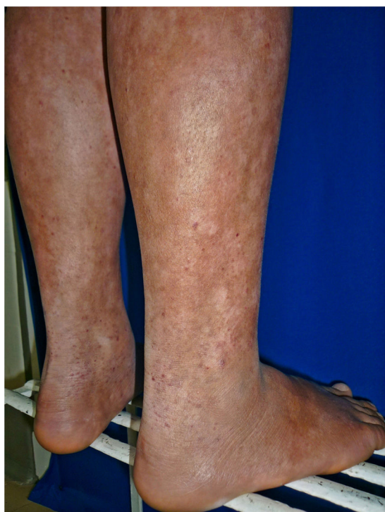
Figure 2 Capillaritis-type mycosis fungoides in an adolescent.