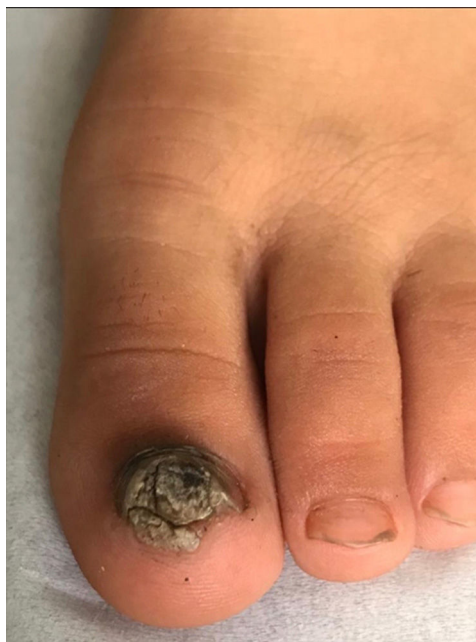
Figure 1 Brown subungual hyperkeratosis and onycholysis.

Bowen disease of the nail fold is one of the main differential diagnoses of subungual warts. Advanced age, recurrent and recalcitrant nature are elements that often signal Bowen's disease. Dermoscopy can also be helpful and