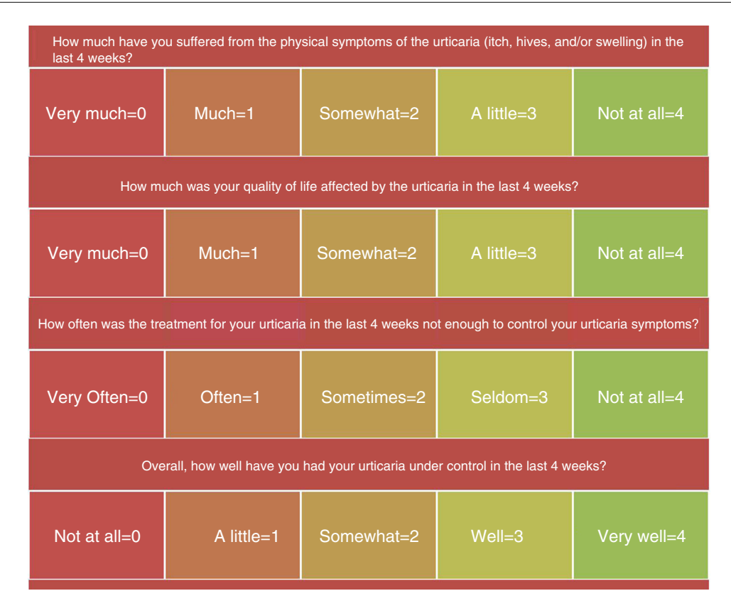
Figure 3 Urticaria Control Test.