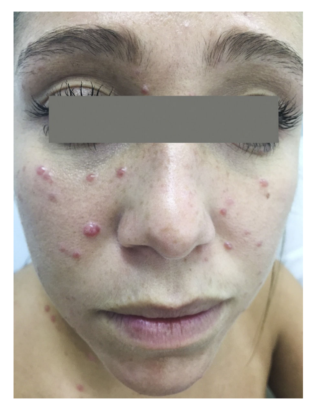
Figure 1 Diffuse scattered non-follicular based flesh-colored papules and small nodules, some with central indentations, were seen on the face and the trunk.

The classic presentation of CRDD is a relatively asymptomatic self-involuting nodulo-plaque with surrounding satellite papules.<sup>3</sup> However, an evolving wide spectrum of clinical morphologic presentations have been reported. The most common site involved is the face, followed by thigh, and trunk. Recurrence has been reported to occur within 1