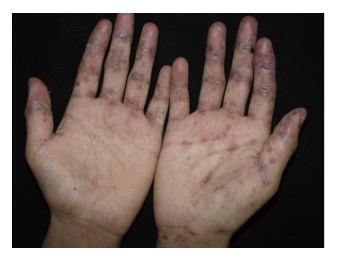
Figure 4 Several erosions on the palms of the hands, often recalcitrant.

Patients with PNP can develop life-threatening restrictive bronchiolitis obliterans. The frequency of the involvement