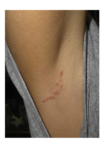
Figure 1 Papules arranged linearly in the right axilla.

Histopathologic findings showed a dense dermal infiltrate composed of eosinophils, lymphocytes, and cells with