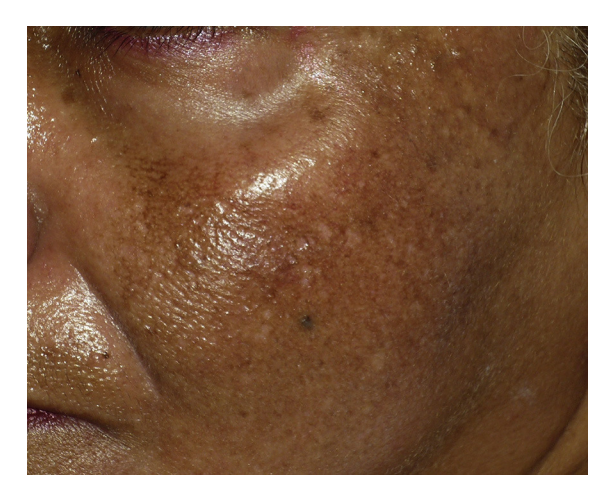
Figure 1 Clinical photograph of the patchy, granular hyperpigmentation present in the left temporal region.

The patient's skin was phototype V of the Fitzpatrick classification. Physical examination revealed poorly defined patches of hyperpigmentation formed of palpable minute grayish papules on a brownish base bilaterally in the malar, zygomatic, temporal, and supraciliary regions. No signs of