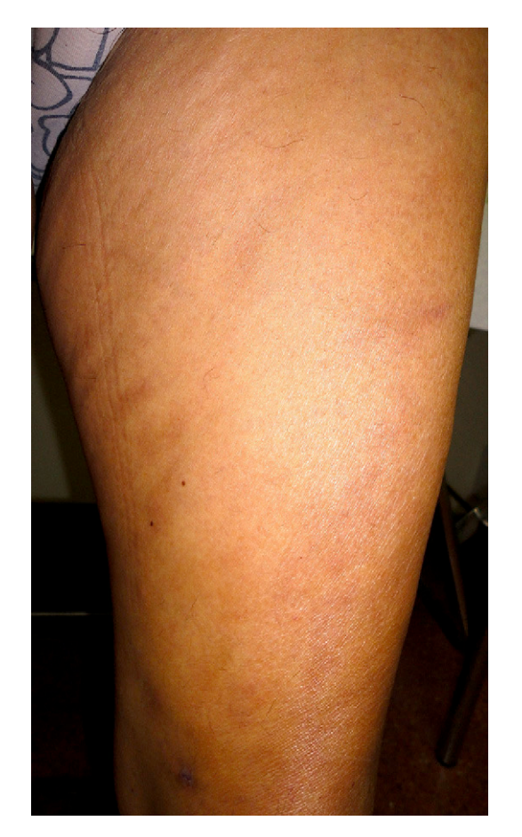
Figure 1 Oval, pigmented macules with poorly defined margins on the anteromedial aspect of the thigh.

the summer months, and no other cutaneous or systemic manifestations were observed after 1 year of follow-up.