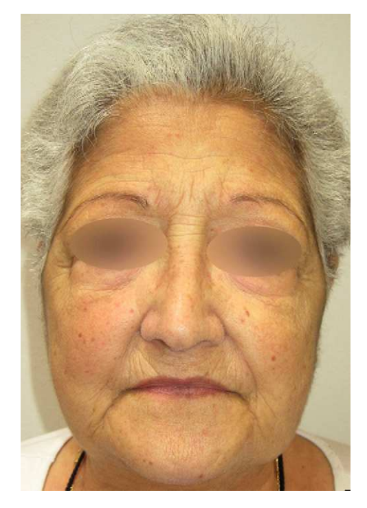
Figure 2 Yellow discoloration induced by quinacrine.

Quinacrine, also known as atabrine or mepacrine, is a synthetic derivative of quinine that was introduced in 1930 to prevent and treat malaria. Since then it has also been used for the treatment of giardiasis, taeniasis, and lupus erythematosus. <sup>1,2</sup> Its chemical structure differs from that of chloroquine and hydroxychloroquine due the presence of an additional benzene ring. It is less effective than other antimalarials, but has the advantage of not causing retinal toxicity. This compound is not commercially available in Spain, but can be acquired through hospital pharmacy