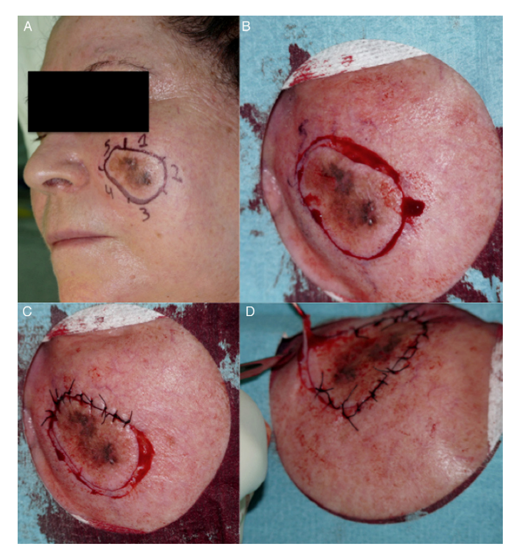
Figure 2 A-D, Excision of a strip of skin around the lesion, by sectors, and suture of the defect.

the lesion is then removed with full assurance that excision is complete. The initial proposal involved a square or polygonal excision to facilitate the cutting and orientation of the surgical specimen, but depending on the site of the lesion, rounded or polygonal forms are now possible with the use of photographs or marker sutures to indicate the orienta-