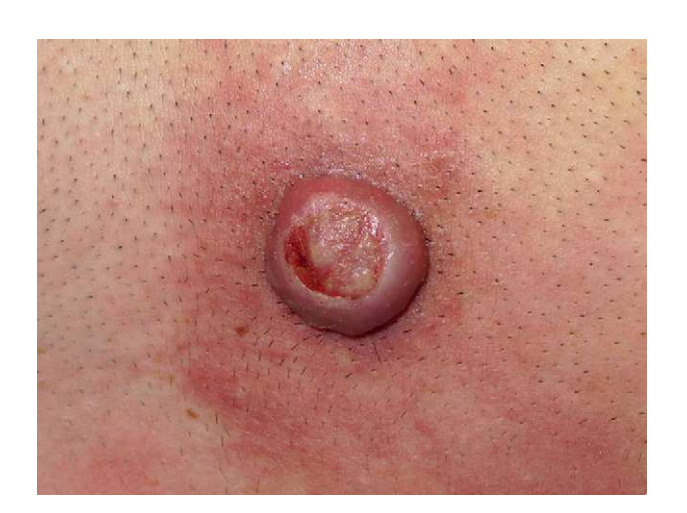
Figure 1 Erythematous-violaceous nodule on the chest with a rolled erythematous border and central ulceration.

A 40-year-old man with no past history of interest and who did not smoke or drink consulted for an asymptomatic lesion that had been present on his chest for 2 months. He did not recall a previous injury, insect bite, or pre-existing lesion. Physical examination revealed an erythematous-violaceous nodule measuring 2.5 \times 2 \, \text{cm} on the anterior aspect of the chest (Fig. 1). The nodule was firm, was not