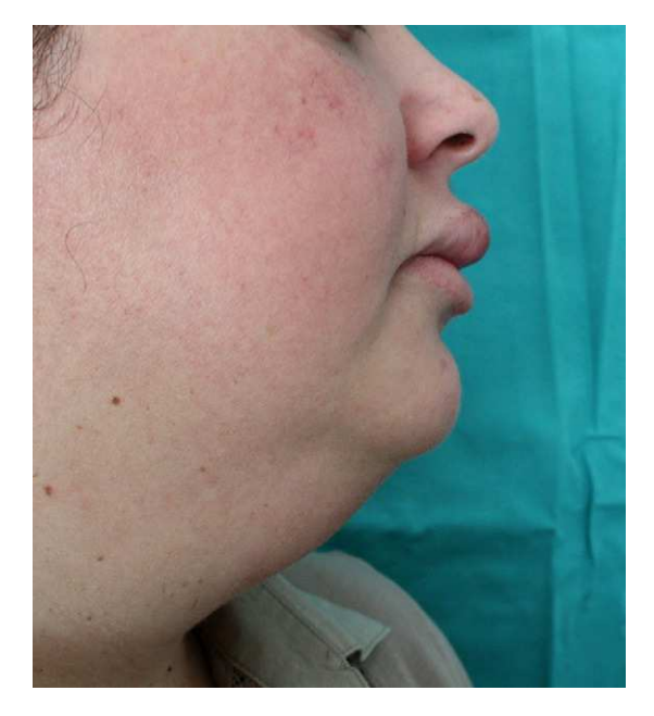
Figure 4 Involvement of the perioral region, including the submandibular region and both cheeks in patient 6.

The patients were prescribed different treatments including infiltration of triamcinolone (0.1%), sulfone, oral corticosteroids, tetracyclines, hydroxychloroquine, and