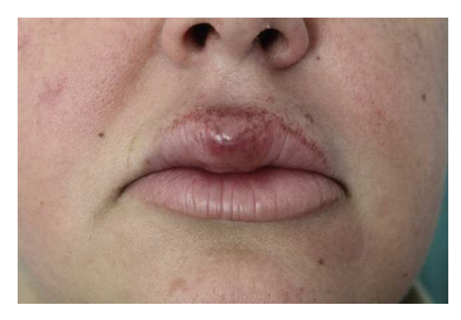
Figure 1 Persistent swelling of the upper lip in patient 6.