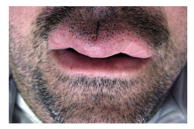
Figure 3 Swelling of the upper lip in patient 5.

had recurrent episodes of periodontitis that were treated with antibiotics, were not associated with the exacerbation of granulomatous cheilitis, and did not coincide with flareups of the disease. No foci of infection associated with a worsening of the lesions were detected in any of the other cases.