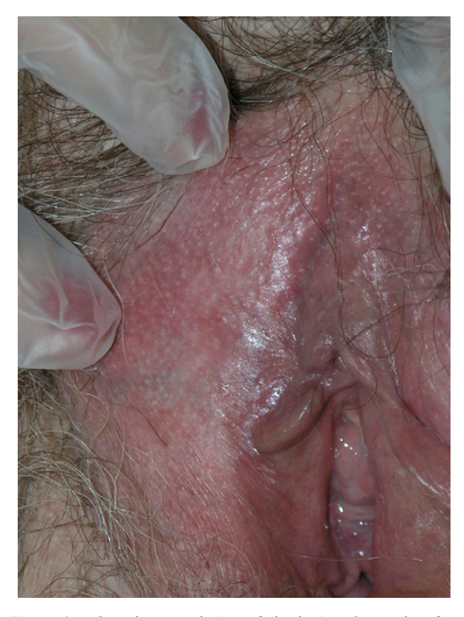
Figure 3 Complete resolution of the lesions 3 months after completion of treatment.