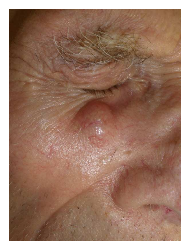
Figure 1 Nonulcerated malar nodule.

A 72-year-old man was assessed for the sudden onset of an asymptomatic lesion in the malar region associated with a slight worsening of dyspnea but no sputum or fever. The patient had a history of chronic obstructive pulmonary disease for which he had been receiving treatment for