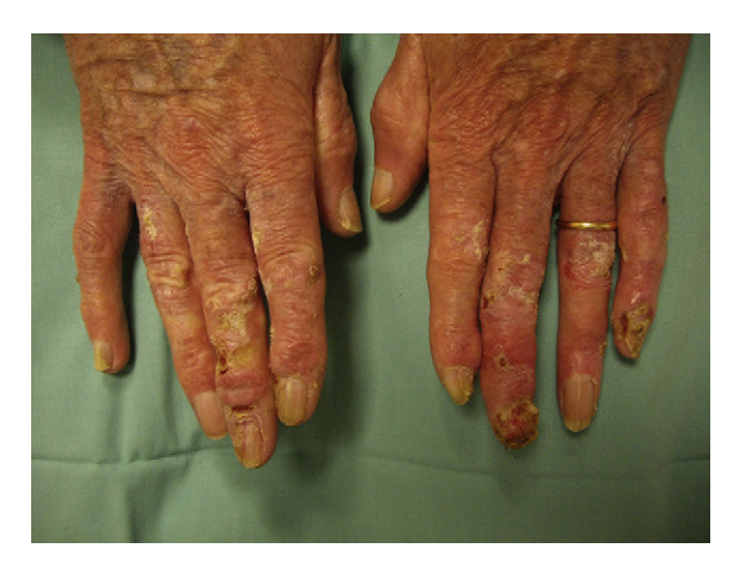
Figure 1 Clinical image before treatment with imiquimod, showing hyperkeratosis and ulcerations on the fingers of both hands.

Imiquimod (Aldara) is an immune response modulator belonging to the family of imidazoquinolines. Topical imiquimod stimulates the innate and acquired immune