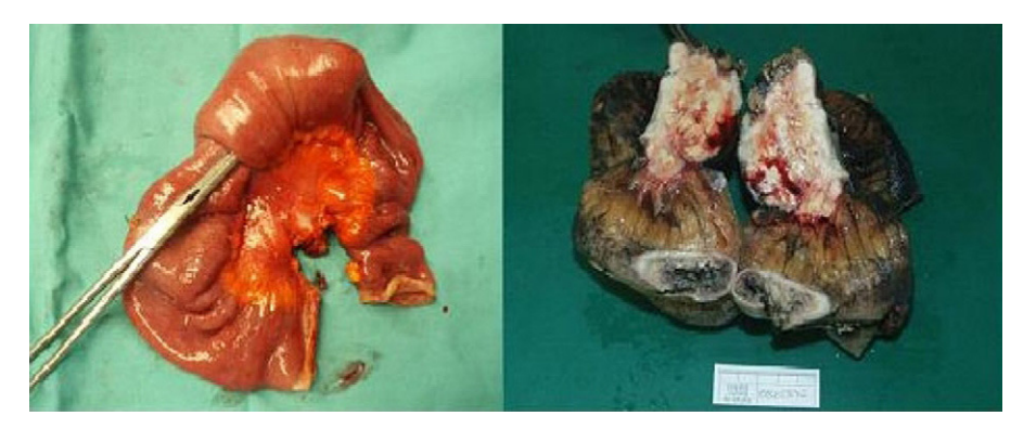
Figure 2 Surgical specimen.

material obtained is essential for the diagnosis of metastatic tumors.<sup>4</sup>