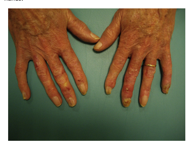
Figure 2 Clinical image after treatment with imiquimod cream, 5%.

responses.<sup>3</sup> By binding to toll-like receptor 7, this drug activates immune cells, inducing the secretion of numerous cytokines with a potential antitumor effect, such as interferon \alpha , tumor necrosis factor \alpha , and interleukin 12.<sup>4</sup> In vitro studies have shown that, in addition to its antitumor activity, imiquimod also has anti-inflammatory, proapoptotic, and antiangiogenic properties.<sup>5</sup>