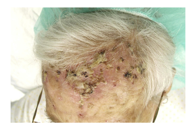
Figure 1 Crusted pustular lesions on the forehead after cryotherapy.

Primary cutaneous aspergillosis is a chronic skin infection that does not appear to affect other organs. It is very uncommon as it is caused by the direct inoculation of the fungus into injured skin. It tends to affect preterm neonates<sup>2</sup> and immunocompromised patients and is much rarer in immunocompetent individuals. 3-5 The lesions, which are usually located at the site of inoculation, are nonspecific and include erythematous macules, pustules, plaques, and nodules that can become necrotic.<sup>2,5-7</sup> The differential