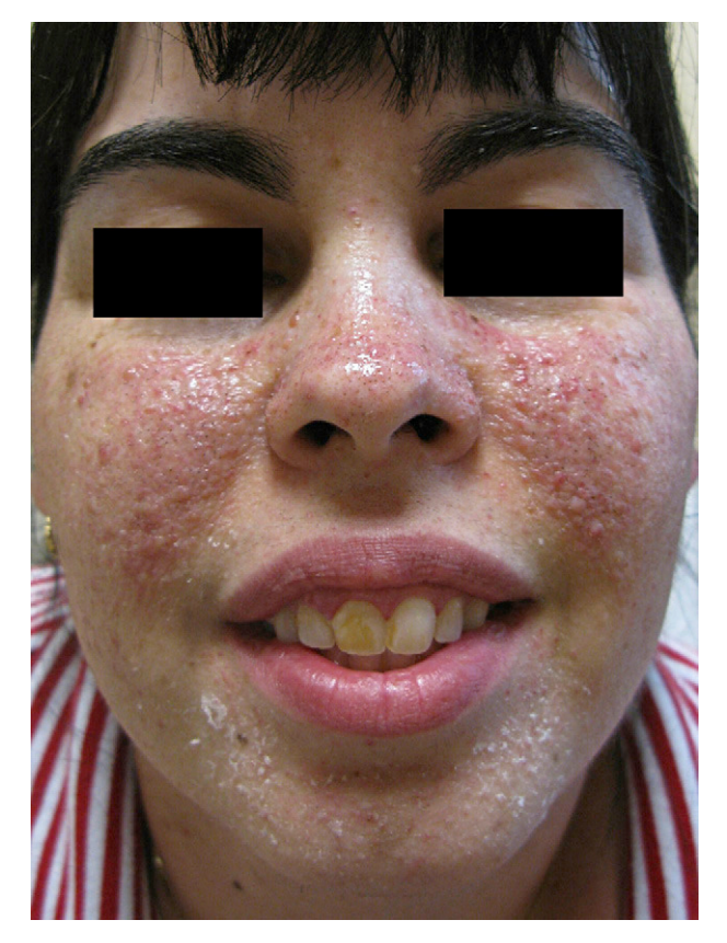
Figure 2 Image of the patient after 3 months of treatment with rapamycin solution (1 mg/mL). Reduction in the number of lesions and marked improvement in the underlying erythema.

tered in 1 or 2 applications per day and, as in our patient, seemed to be well tolerated, with no local or systemic adverse events. The pharmacological basis for the efficacy of rapamycin in treating facial angiofibromas in patients with tuberous sclerosis should be clarified in future studies.