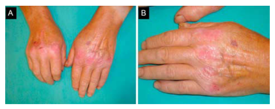
Figure 1 A and B, Nonpruritic, confluent violaceous erythema affecting the skin, present bilaterally, mainly over the metacarpophalangeal joints.

Sunitinib is an oral kinase inhibitor that acts on various receptors, including vascular endothelial growth factor receptors 1 and 3, platelet-derived growth factor receptor \alpha , colony-stimulating factor 1 receptor, and glial cell line-derived neurotrophic factor receptor. It also blocks the expression of various proteins, especially proteins KIT/CD117 and Flt-3.4,5 Approved indications for this drug currently include gastrointestinal stromal tumors resistant to treatment with imatinib and metastatic kidney cancer. 4,5 Hand-foot skin reactions and stomatitis are the 2 most important adverse skin reactions to this anticancer drug and have been described in 36% of cases. 1-6 These hand-foot reactions are characterized by the appearance of erythematous-desquamative plaques that progressively develop a rough keratin layer on their surface in the form of a callus.6 These lesions characteristically appear at pressure points on the palms and soles, and sometimes appear as lesions on the dorsal aspect of the fingers. In our patient, the palms and soles were completely unaffected.