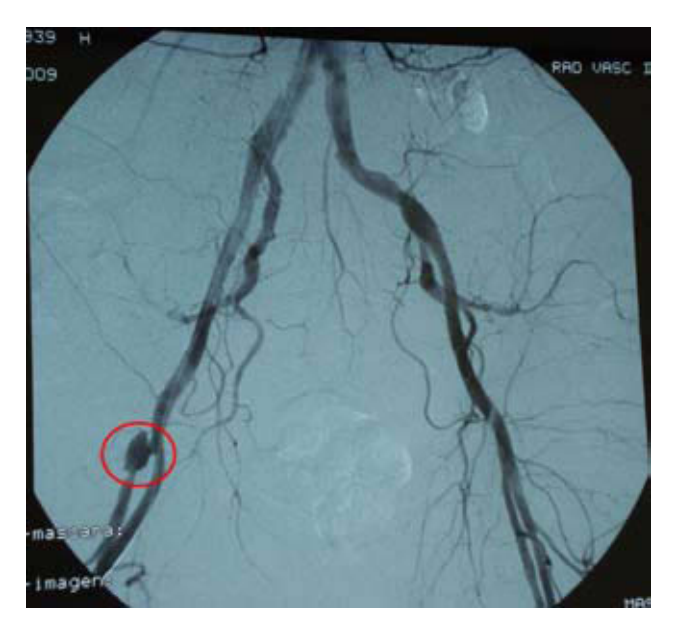
Figure 4 Arteriography revealed a pseudoaneurysm of the right deep femoral artery (within the circle).

infectious pseudoaneurysm was surgically repaired. This achieved complete resolution of the condition.