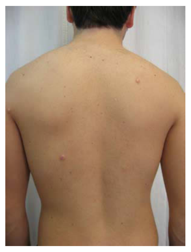
Figure 1 Pink growths, suggestive of keloids, in locations where the patient previously had melanocytic nevi.

before applying the product, and is informed that the lesion will darken within about 20 minutes and eventually form a scab that will fall off in 7 to 10 days. The website states that Wart & Mole Vanish has won several awards at fairs and conventions, and also that it has been tested in extensive clinical studies conducted in Asia, although no details of the nature and scope of these studies are provided. The