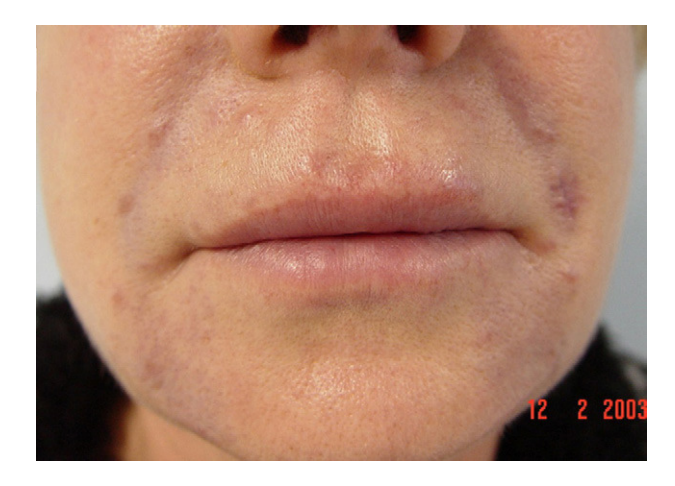
Figure 2 Infiltrated plaques in the nasolabial folds and on the upper lip.