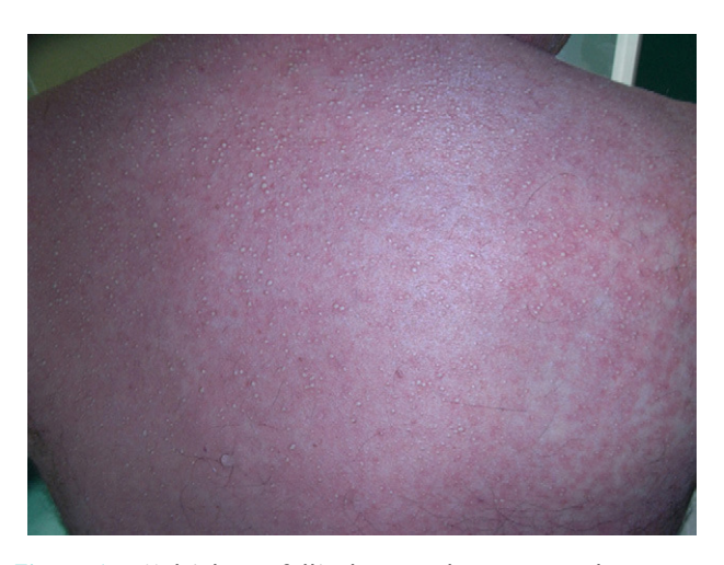
Figure 1 Multiple nonfollicular pustules on an erythematous, edematous base.